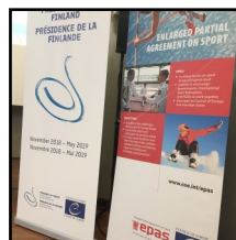
Expert Conference on Sexual Violence against Women & Children in Sports