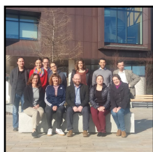
CPSS hosts CASES kick-off meeting