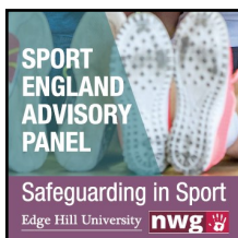
The Sport England Advisory Panel